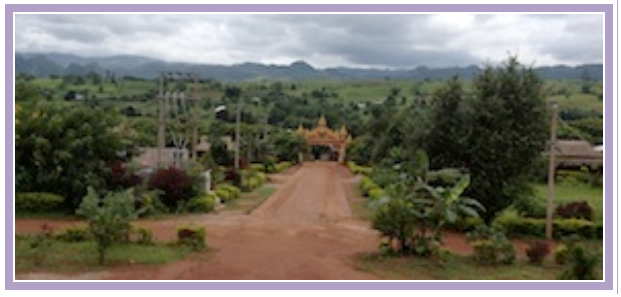
Naung Taung Monastery in Pa-O area near Taunggyi

During October after returning from the US, I was able to meet with members from Hope International (based in yangon) to discuss their projects to start schools for the Kachin groups in Northern Shan State. They will be starting with 8 schools in Northern Shan State and Whispering Seed has been asked to assist in some design work and building of extra classrooms and schools using earthen building and a design process in which the students, teachers and community will be helping to design and build the schools.