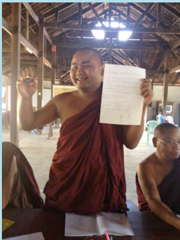
Inspired monk ready to "green" his monastery

With the senior abbots approval, the teachers can then be trained and begin implementation of new teaching methods and models within their classrooms. The brief gathering inspired the group of abbots and they are already making plans for themselves and their teachers to gain further training.