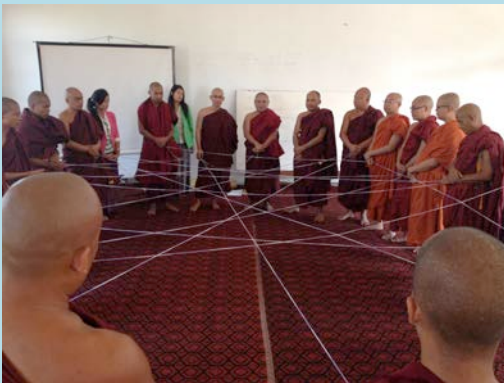
Spider Web game to support networking

In April, Naung Taung Monastic School near Taunggyi in Southern Shan State, hosted an Abbot Retreat for 3 days. The retreat was a key time for bringing a core group of senior abbots from all over Southern Shan State in Easter Myanmar together to share experiences, network and begin collaborations together. It was also a key time to expose them to new ideas around holistic education and sustainability.